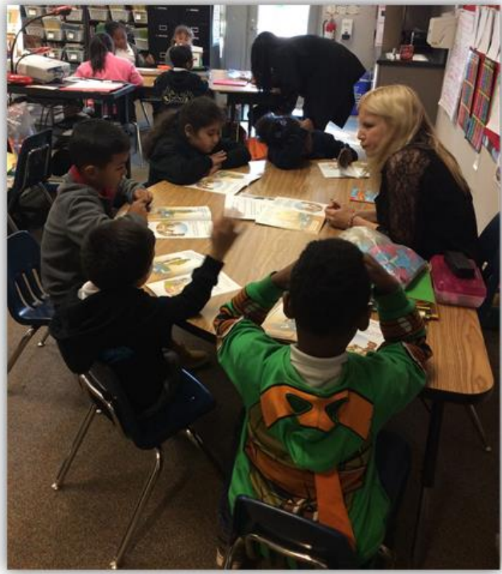
Students using leveled readers during differentiated small group instruction