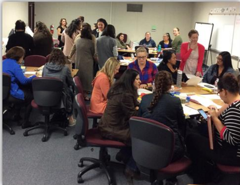
Grade 1 teachers collaborating on Foundational Skills